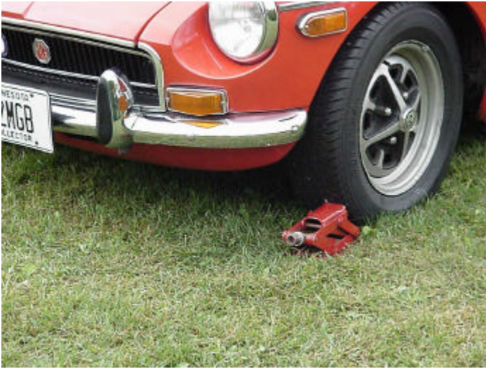
Several of the MG's on exhibit used a modified improvisational, dynamic impairment parking brake.