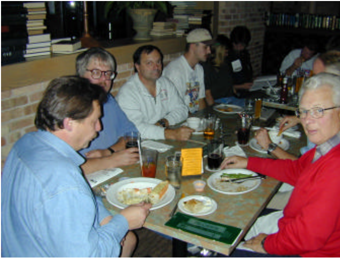
Conviviality at The Library, Part II, featuring the "Silver Fox"