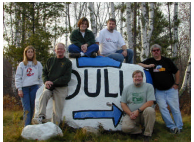
Requisite Oulu Rock Photo with some of the trekies missing