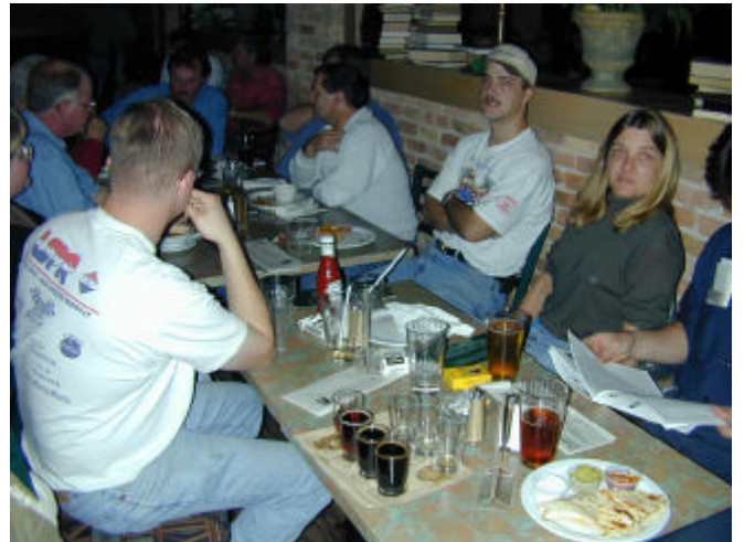
Conviviality at The Library