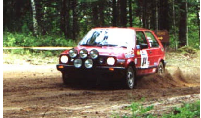
J.B. Niday and Al Kintigh in the relatively new Golf plowing furrows in the trail. J.B. must have finally linked up all the holes in the old Fiesta and it just disappeared.