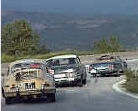
Parade of ATW rally cars on Day 6, somewhere in Greece?

According to trusty reporter Syd Stelvio, Julie made border crossings by hiding under a tarp and some blankets in the back seat.