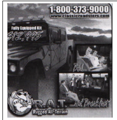
Classic Roadsters Ad - AutoWeek, 03-27-00

This new vehicle will take chassis and drive-train components of the Suburban and wrap them with body panels that look like Arnold Schwarzenegger's favorite Rodeo Drive commando vehicle. While the real Hummer comes in at something over $80,000, the new GM product will be priced at something less than $50,000. For the extra $30,000 you get truly intimidating size, tires that can be inflated and deflated on the fly and a really obnoxiously noisy diesel engine.